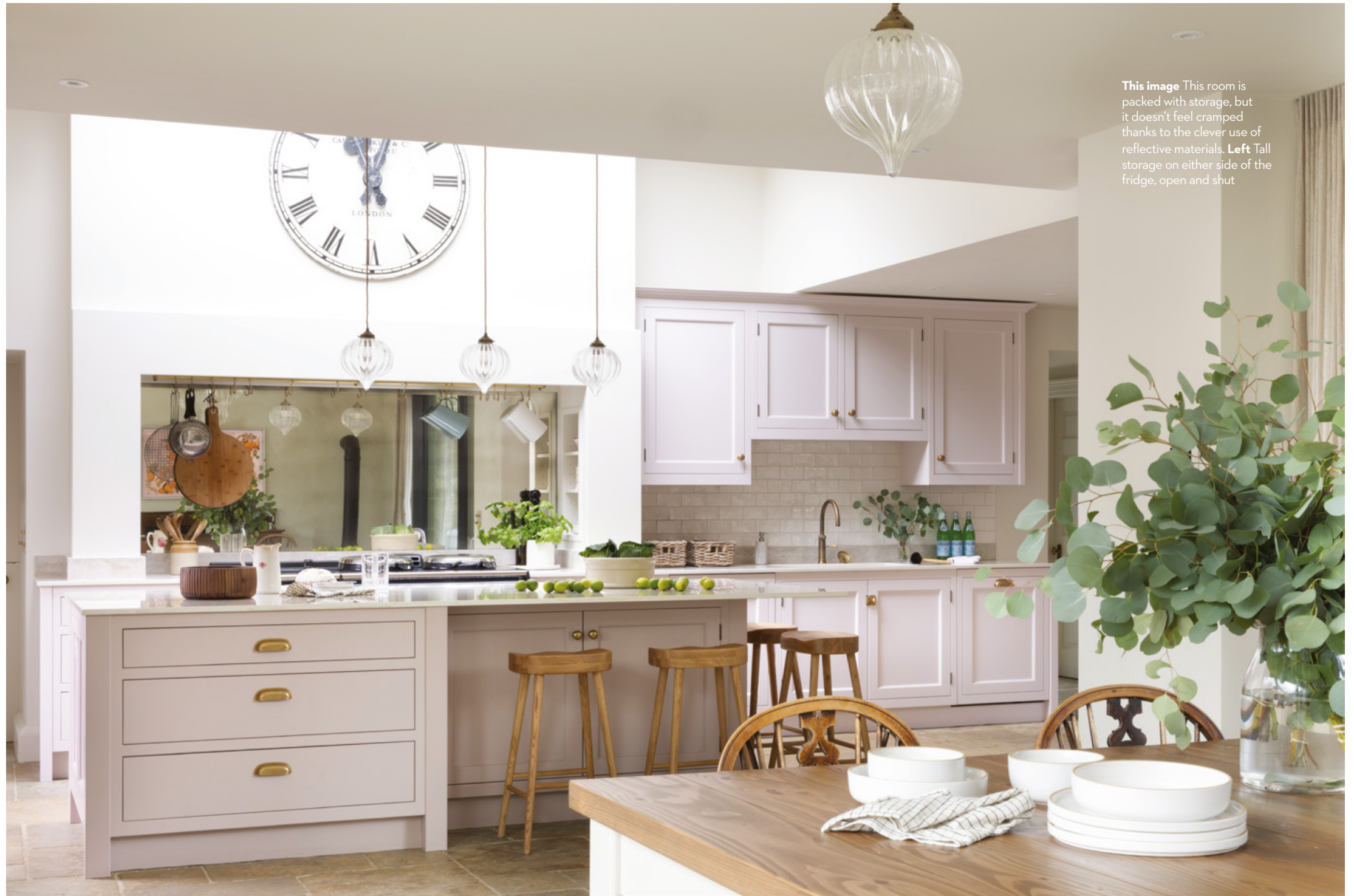
This image This room is packed with storage, but it doesn’t feel cramped thanks to the clever use of reflective materials. Left Tall storage on either side of the fridge, open and shut

Every corner of this generous space has been designed with the family’s needs in mind. The multiple seating options allow for an easy flow throughout, and provide spots for hosting, homework and culinary ▶