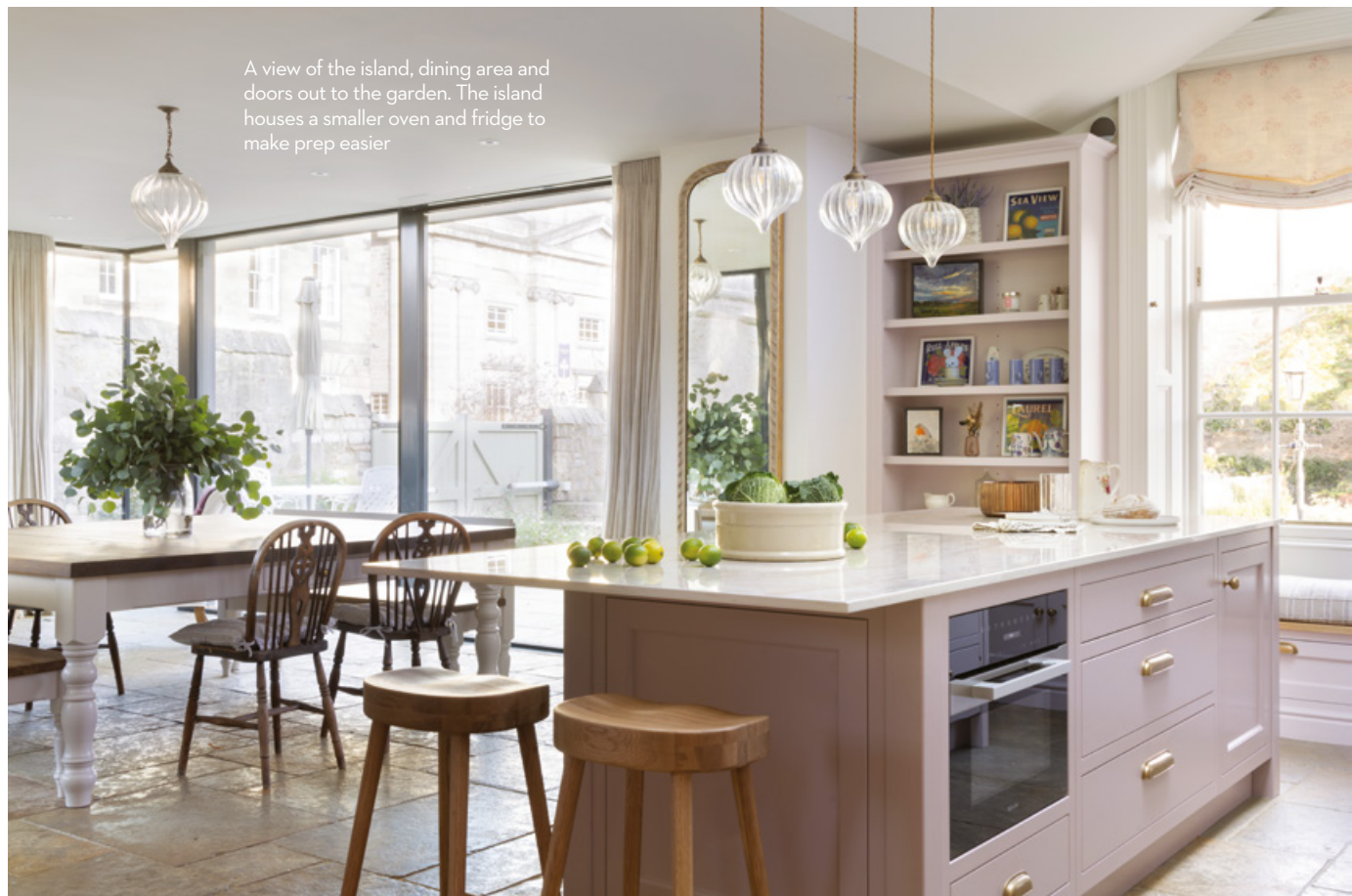
A view of the island, dining area and doors out to the garden. The island houses a smaller oven and fridge to make prep easier

Although not technically part of the main kitchen, this bespoke utility deserves some attention. “I really love this utility - it’s probably one of my favourites I’ve done,” says Adam. “There’s an everyday coat-hanging area and a bench seat for putting on wellies. We even got aged brass name plates made for the doors engraved with everyone’s initials. It’s purposefully not rammed with furniture for the sake of it, just enough for the storage required, and plenty of room to manoeuvre a child’s buggy.”